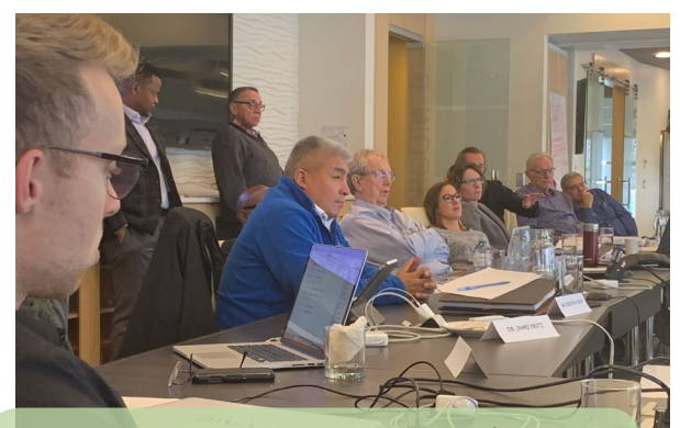
L-R: Council Members and College Staff discussing possible initiatives during a plenary session.

A new strategic plan is always an exciting opportunity. It will be a challenge to operationalize this new plan and we look forward to working with you on these goals that ultimately contribute to our mission to "To serve the public by regulating the practice of medicine and guiding the profession to achieve the highest standard of care."